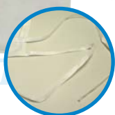
Neck & waist ties/strings