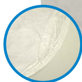
Bound seam round corners