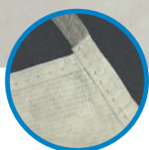
Strongly stitched 8/inch