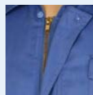
Storm flap closure with zipper & snap button