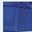
Elastic waist & on back