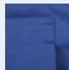
Double stitched & bar tacked stress points