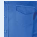
Two chest pocket with flap