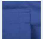
All stress point are bar tacked & fully double stitched