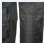
Knee pad reinforcement