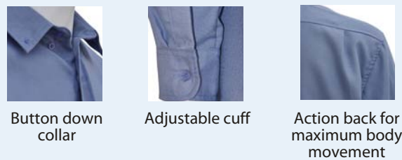
Button down collar