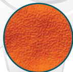
HI-VIZ LATEX COATED