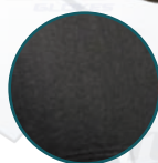
SOFT PALM TEXTURE