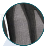
MICRO NITRILE FOAM