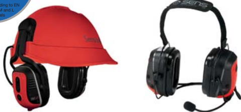
Helmet Mount (HM)