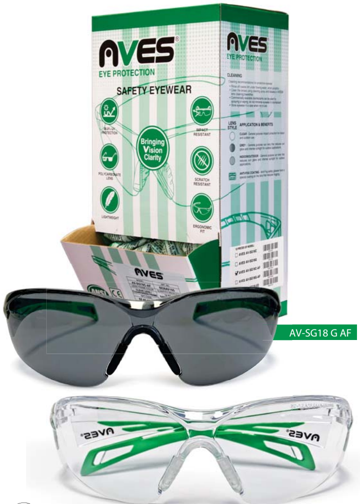
AV-SG18 G AF