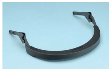
AV-VB10 Visor Bracket Article No.: 3481AV392

• To keep with NFPA 70E requirements we suggest to purchase our Arc Flash Kit System instead. We have 4 types of systems available: AV-ARC-1, AV-ARC-2, AV-ARC-3, AV-ARC-4.