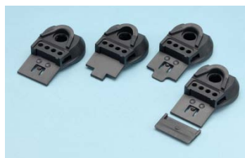
AV-SA30 Slot Adapters Article No.: 3482AV393