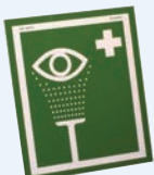
• Eyewash Sign