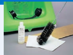
• Eyewash Station Cleaning Kit