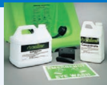
• Defend® Water Preservative