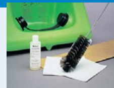
• Eyewash Station Cleaning Kit