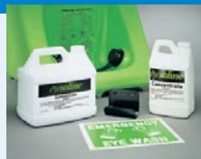
• Defend® Water Preservative