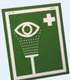
• Eyewash Sign